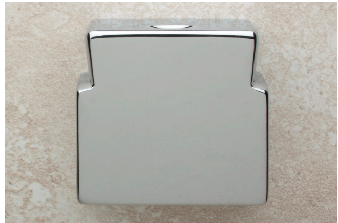
ComfortFlo Steam Head