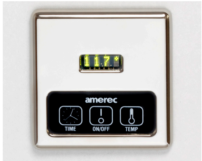
K60 Digital Control